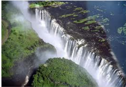
The Majestic Vic Falls.

first European to view Victoria Falls on 16 November 1855 from what is now known as Livingstone Island, one of two land masses in the middle of the river, immediately upstream from the falls on the Zambian side. Livingstone named his discovery in honour of Queen Victoria, but the indigenous name, Mosi-oa-Tunya—"the smoke that thunders"—continues in common usage as well.