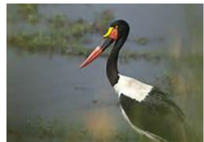
Saddle billed stork – Chobe.

We have the late afternoon, evening, free before going for dinner