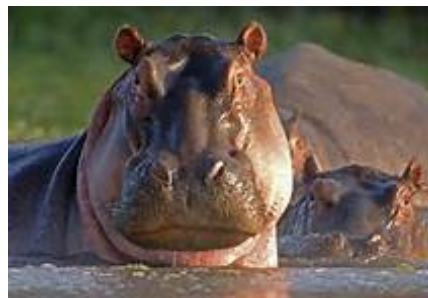
Hippo in the Okavango.

After another great African sundowner, we go to dinner before we turn in for the night.