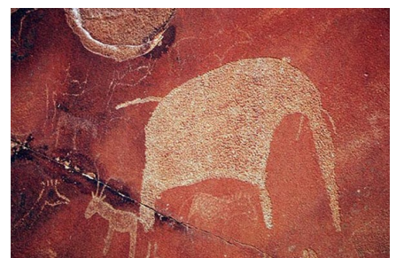
Bushman rock engravings

Today we head into one of the most beautiful desert regions in Namibia, Damaraland. We drive west via the Grootberg Pass and then take a detour to visit the ancient Bushman rock engravings at Twyfelfontein.