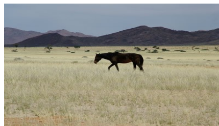
Scenery of Aus.

N.B: The "Catamaran Cruise" is subject to availability and, if undertaken, will be for the clients own risk and expense.