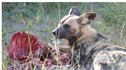
African wild dog

After breakfast we leave Zimbabwe, destination Namibia. Passport formalities completed you go directly into the Mahango Game Reserve, a small but excellent park right on the edge of the Okavango River. Game drive your way through Mahango and have the chance to spot rarely seen Namibian species such as roan antelope the majestic sable antelope.